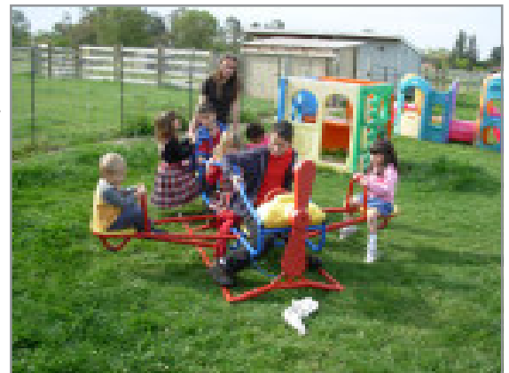
This is a new piece of playground equipment the children are enjoying.