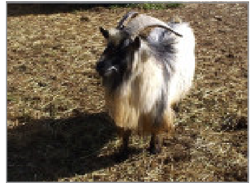
Meet Tornado, one of Small Cloud's farm animals.