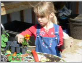
A trip to the nursery: Students were paired and each pair given $20.00 to spend on whatever plants, etc., they wished to place in their garden plot.