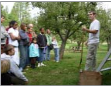
Students learning about the care of apple orchards

Fall is a lovely time of the year here in California. A short drive into the foothills on October 4 took our students into apple country. Their first destination was the Thomas Kinkade Gallery in Placerville. Many of you, of course, have heard of or seen the