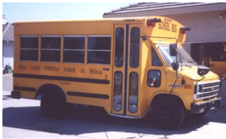
Lettering on the bus reads "SMALL CLOUD CHRISTIAN SCHOOL of Wilton."

The bus is being paid off monthly by God's grace. Not only do we now have a newer bus, but our merciful heavenly Father even provided air conditioning! He has again answered our prayers and supplied our needs. May His name be praised! ■